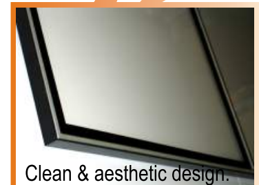
Clean & aesthetic design.