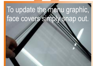
To update the menu graphic, face covers simply snap out.