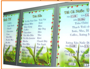
Suction cup lift off cover for quick & easy menu changing